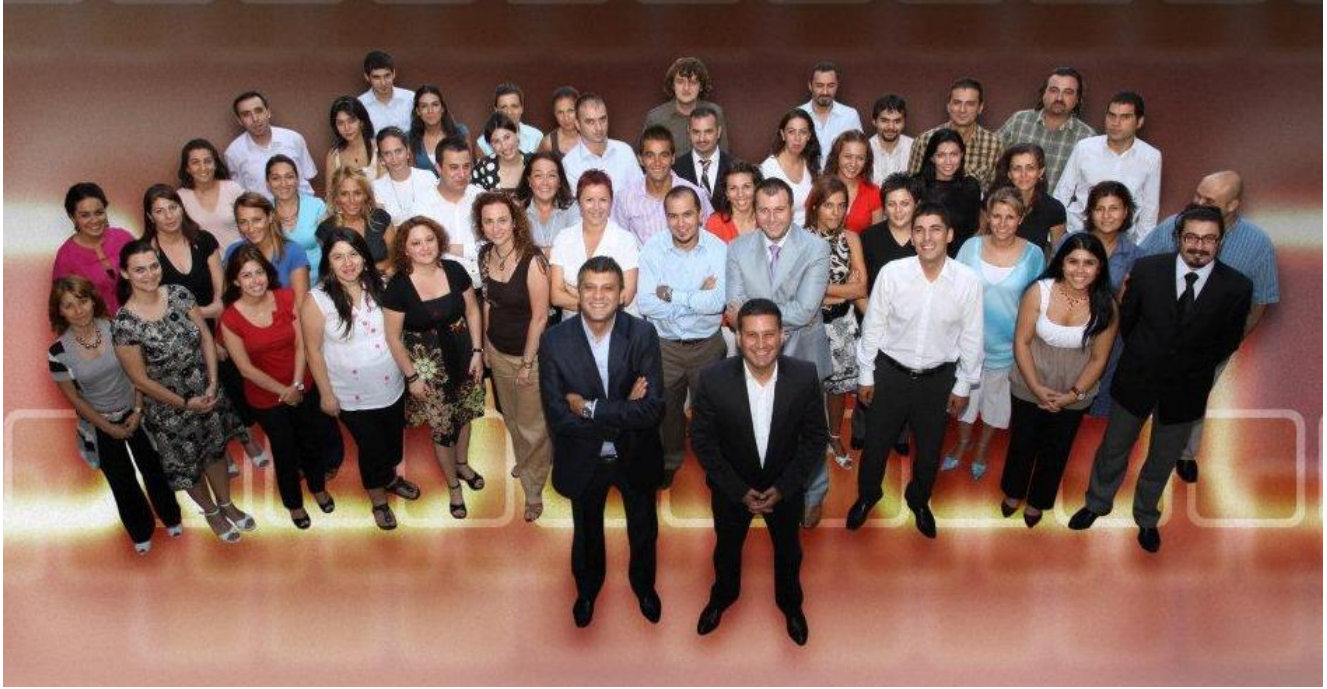
Globelink Unimar Team